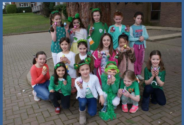
Fort Lucan Fun!