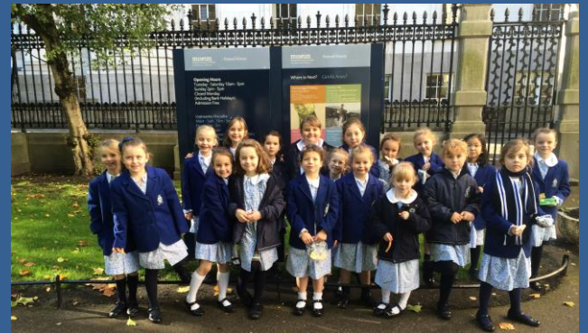
'Dead Zoo' Explorers!

My first favourite time in P1 was Sports Day because I loved skipping and running. My second favourite was going to Fort Lucan. I loved going on the waterslides and the go carts. I loved the ziplines too. Everything was so much fun in Fort Lucan.