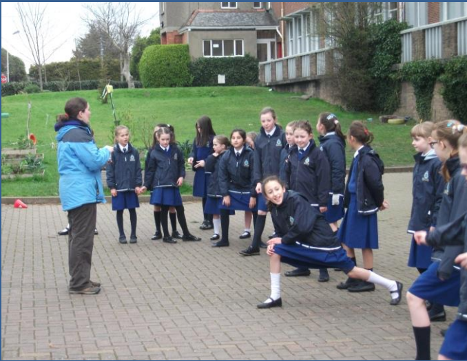
Enjoying our O.W.L.S Workshop...