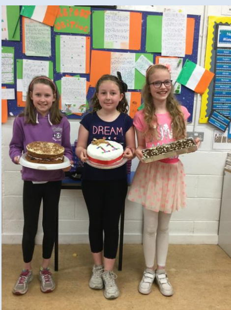
Triple Birthday Celebrations!