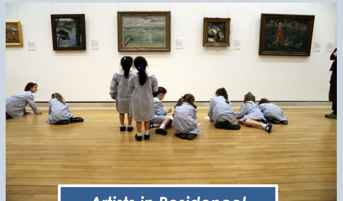
Artists in Residence!