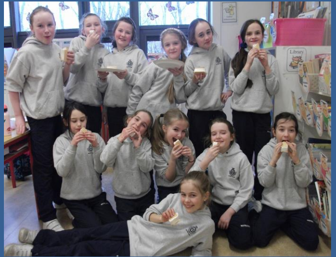
Enjoying our ice creams!