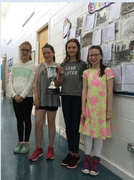
Our Debating 'Juliet Cup' Winners 2016