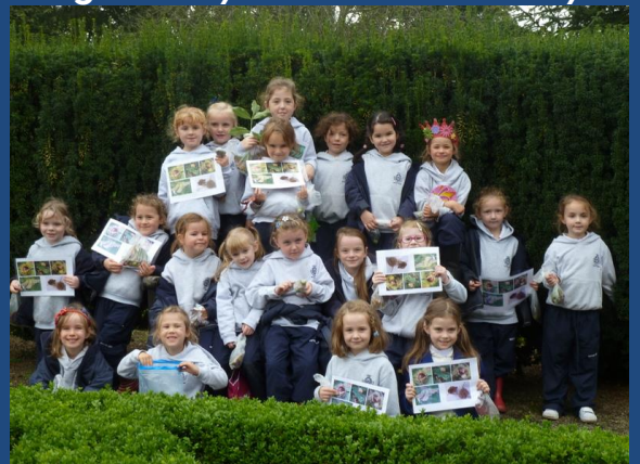
Our Autumn treasure hunt in St Enda's Park.