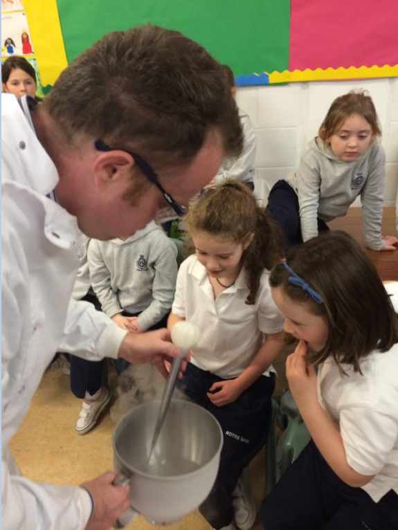
Making ice cream using liquid nitrogen...so exciting!