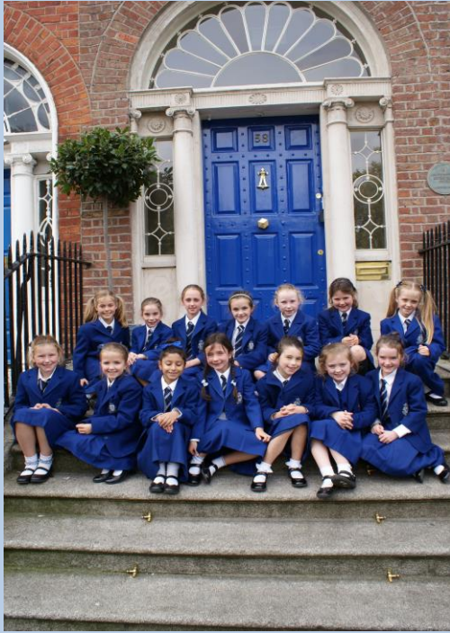
Our trip to the Georgian House.