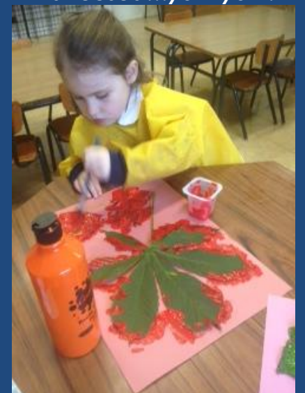
Kim's super leaf painting