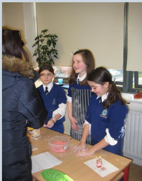
P4 Science Fair Fun!!