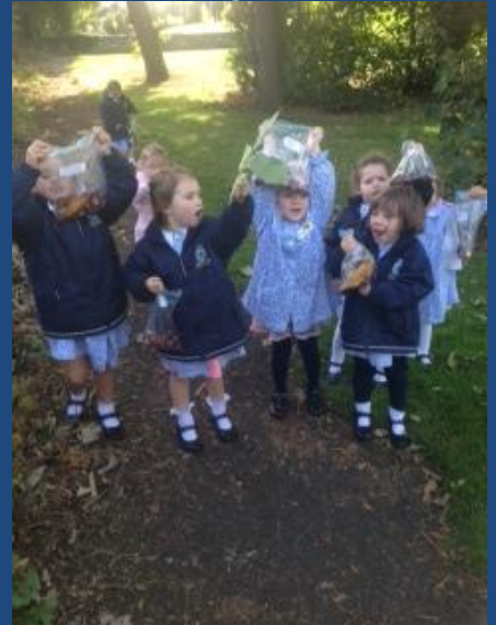
Fun on our nature walk.