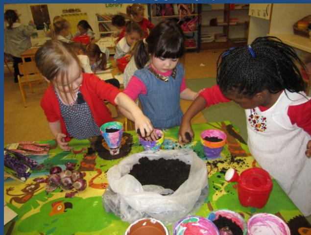
Planting bulbs in our handpainted pots.