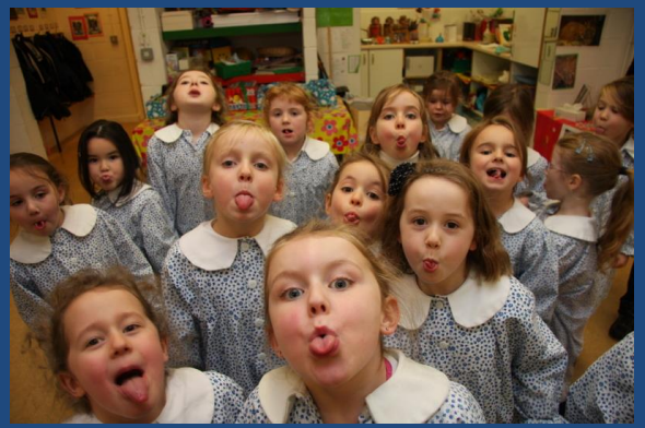
We learned that some of us can roll our tongues and touch our noses with our tongues too!

The wait for Santa will not be much longer and I have full confidence that all the girls will be on the 'Nice list'