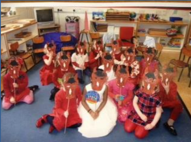
Celebrating the Year of the Horse.