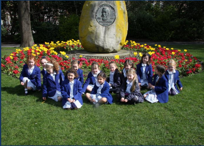
Waiting patiently for...