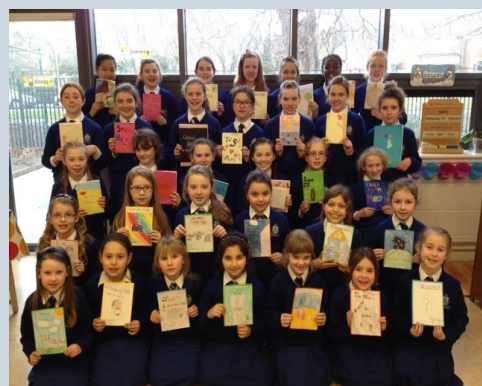
Prep 2 & Prep 6 with their Write A Book Project entries.