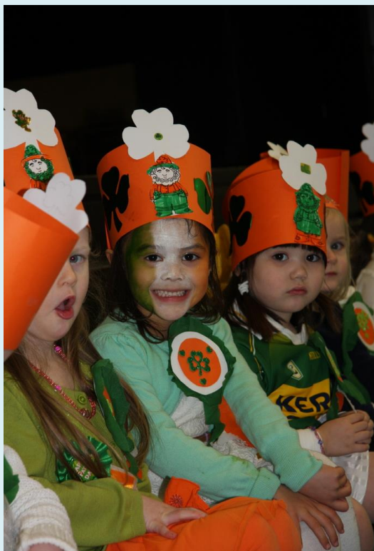
Spraoi Lá Fhéile Pádraig!

Overall a great term, with lots of progress, fun and enthusiasm. Well done girls!