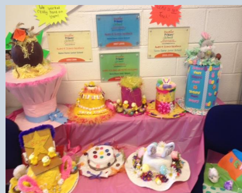
Some of the fantastic Easter bonnets created by Prep 6!