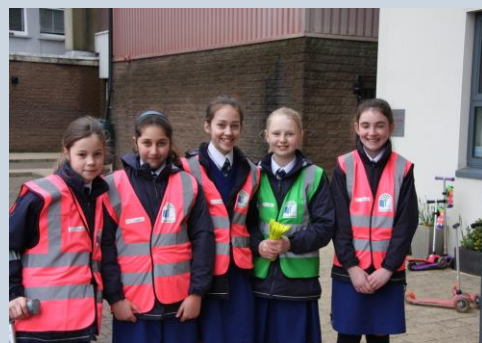
We are well on our way to our 4 th green flag...keep up the walking, cycling and scooting to school!