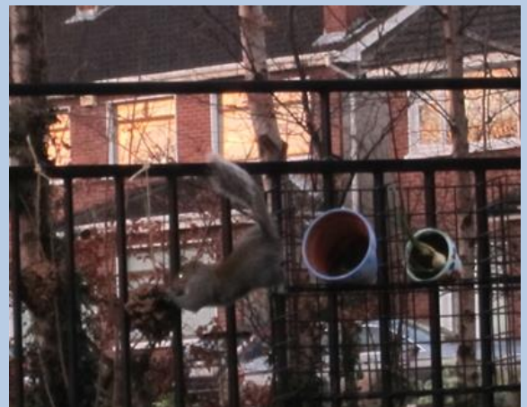
We discovered that they are very good gymnasts too!