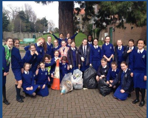
P5 & P6 working together to tidy up our community.