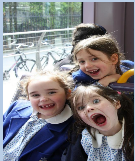
Excitement on the Luas!

We are very busy getting ready for Prep 1 and are nearly ready but there is just a little bit of tweeking to be done. We have also been working really hard on our play with Miss Sandra and might...if they are VERY lucky, invite our mums and dads to see it at assembly next term!