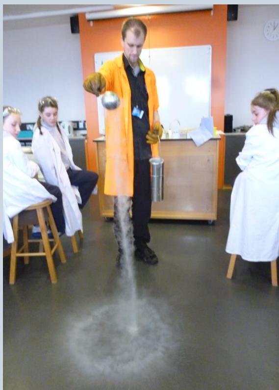
Enjoying the liquid nitrogen experiments.