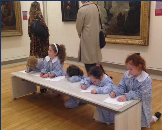
Artists at work!!