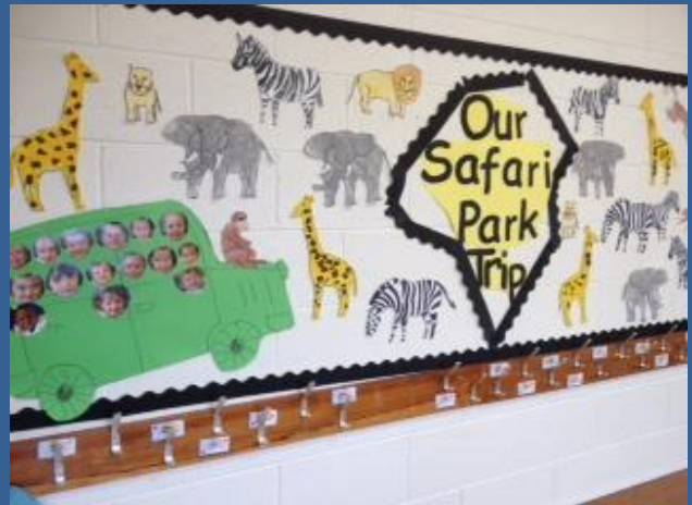
Montessori's Safari Park Trip!

Then it was time to welcome Spring and hear about St. Valentine's quest to keep the spirit of love and friendship alive, despite Emperor Claudius' best efforts to thwart him! The half-term break then ensued, which gave everyone a chance to recharge the batteries and launch back into the second half of term with renewed energy and vigour.