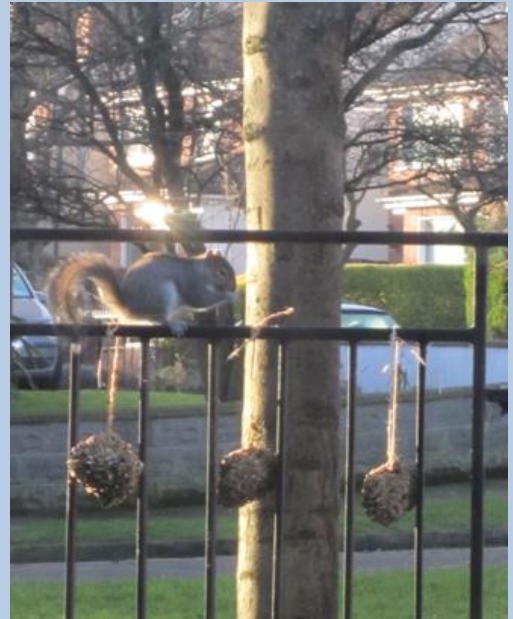
The sneaky squirrels enjoying our bird feeders.